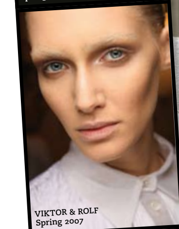
VIKTOR & ROLF Spring 2007