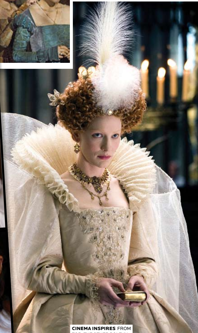
CINEMA INSPIRES FROM TOP: THE OTHER BOLEYN GIRL ; THE GOLDEN AGE ; MARIE ANTOINETTE