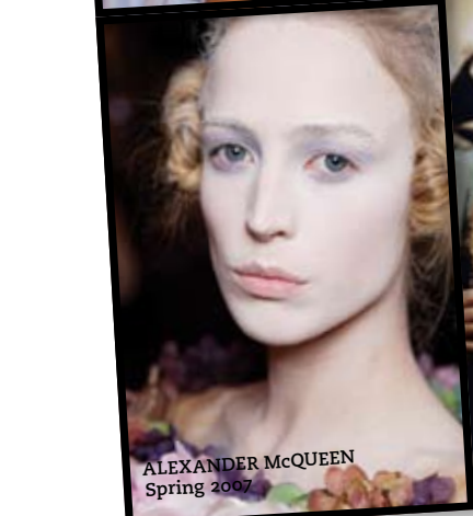
ALEXANDER McQUEEN Spring 2007